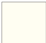
PC 100 NATURAL ☺