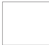
PC 100 WHITE ☺